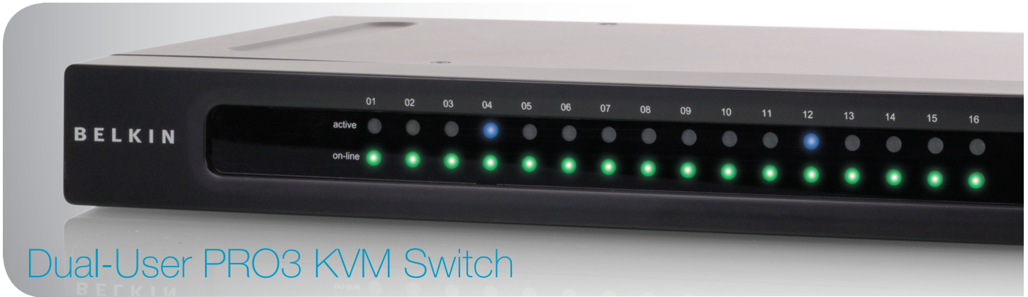
Dual-User PRO3 KVM Switch